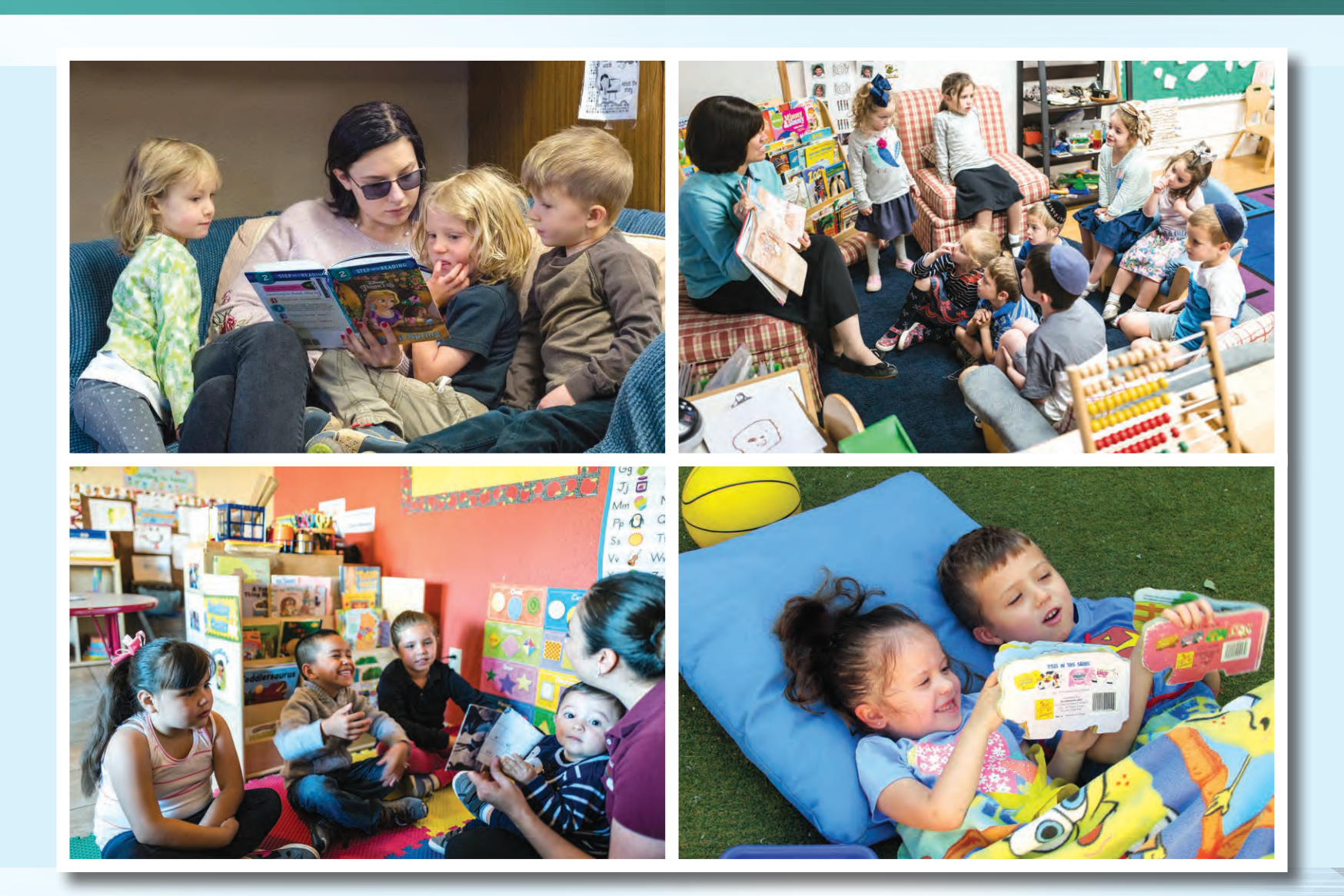
Language and Literacy Standard