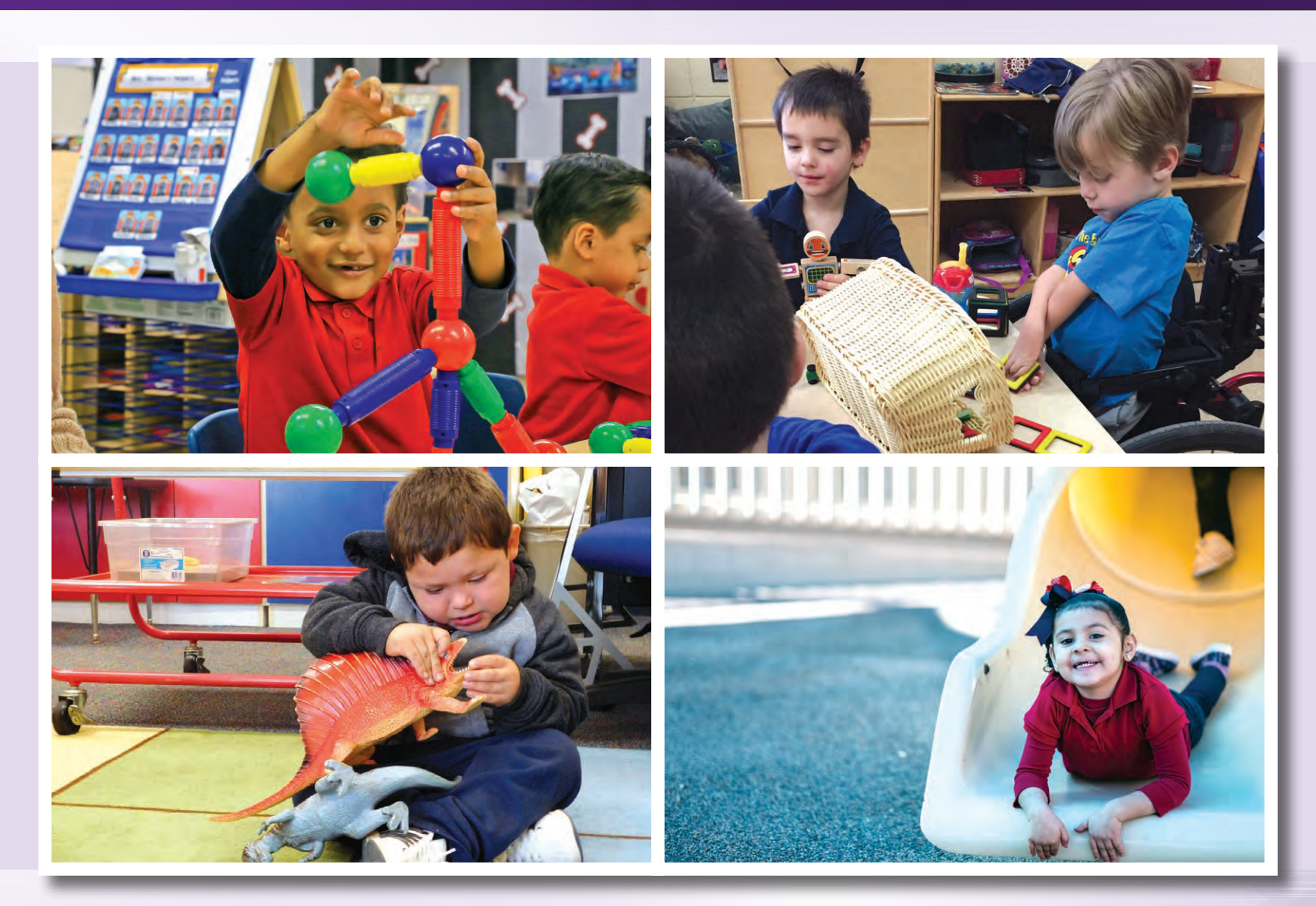
Approaches to Learning Standard