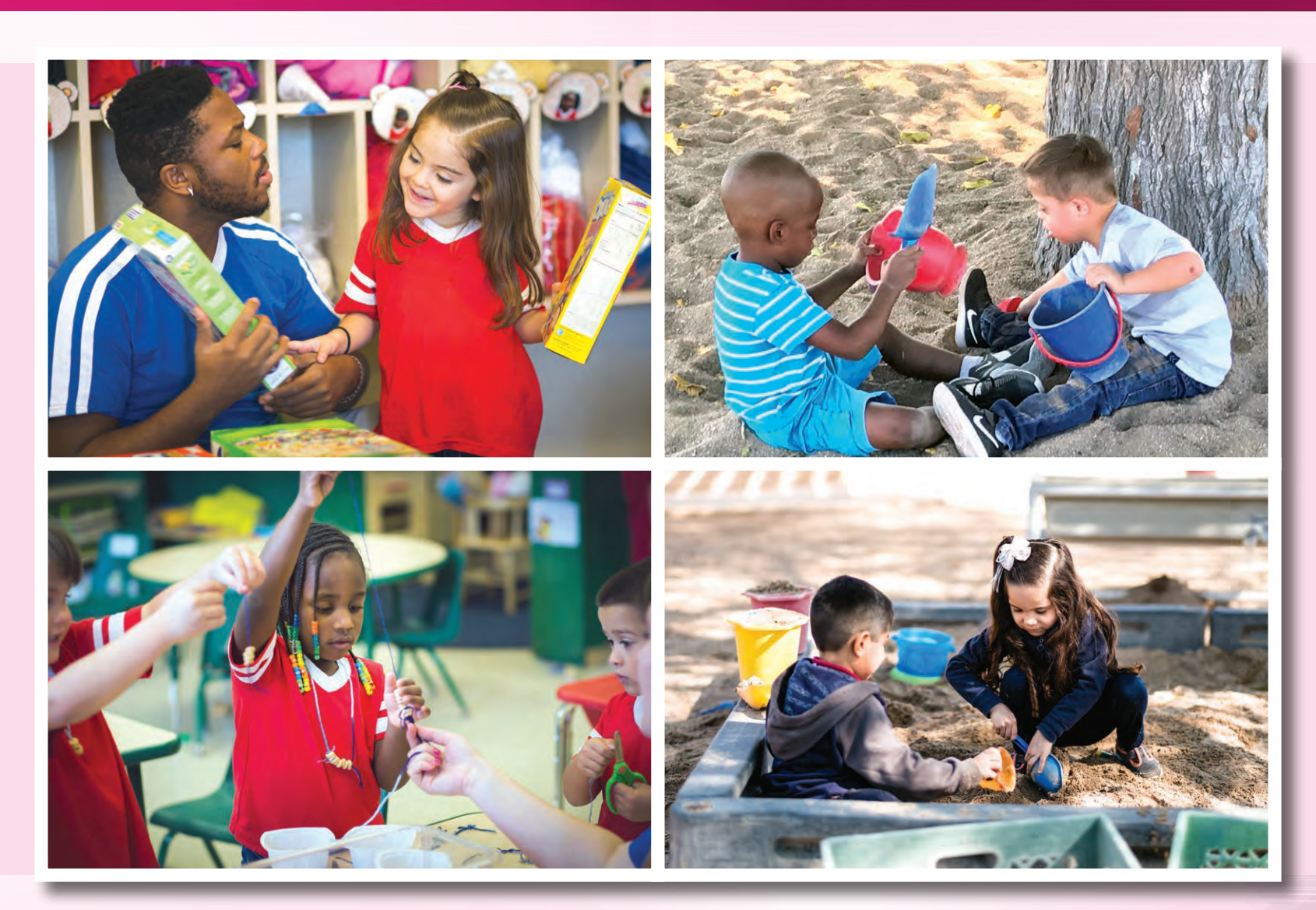
Social Emotional Standard