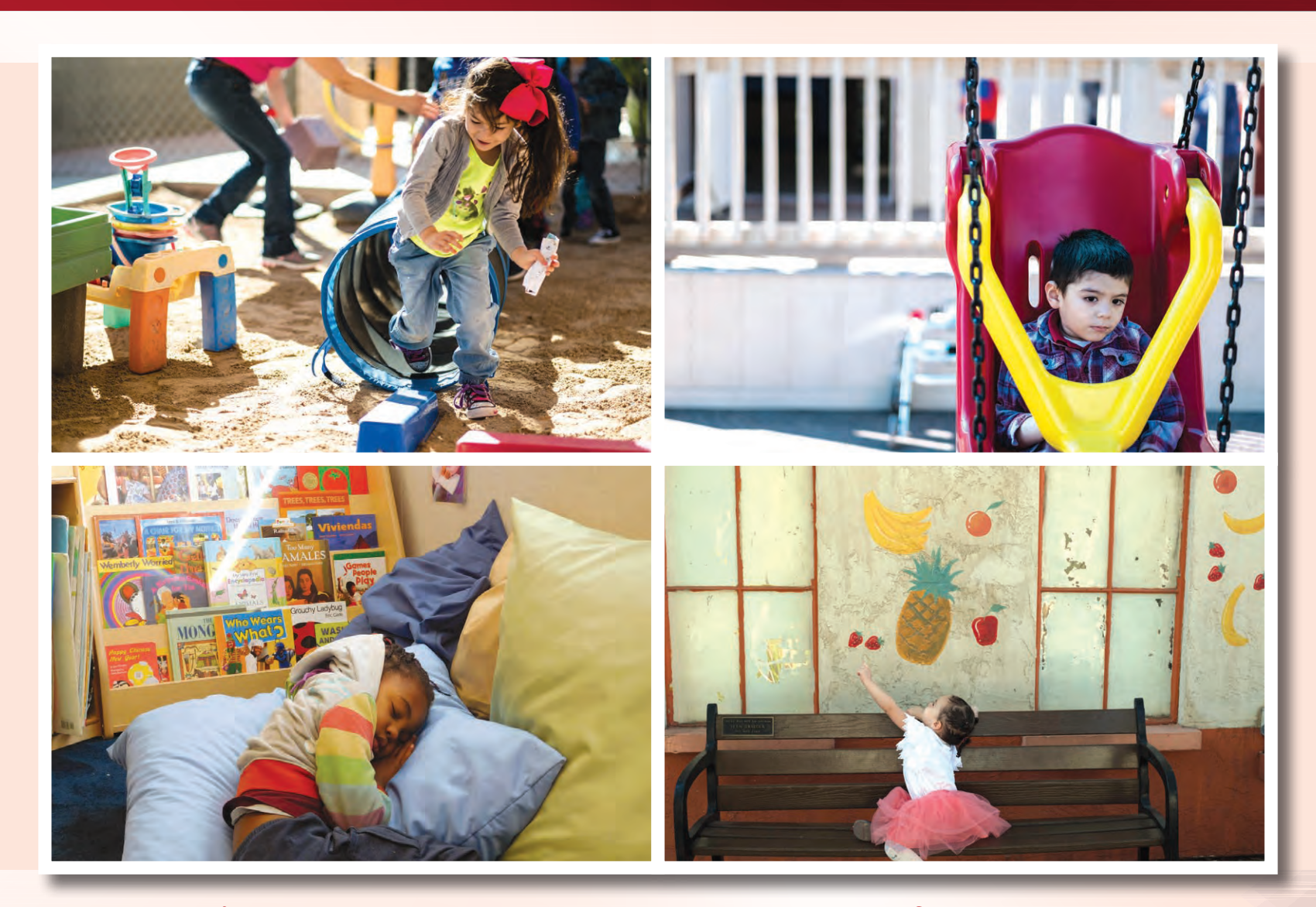
Physical Development, Health and Safety Standard