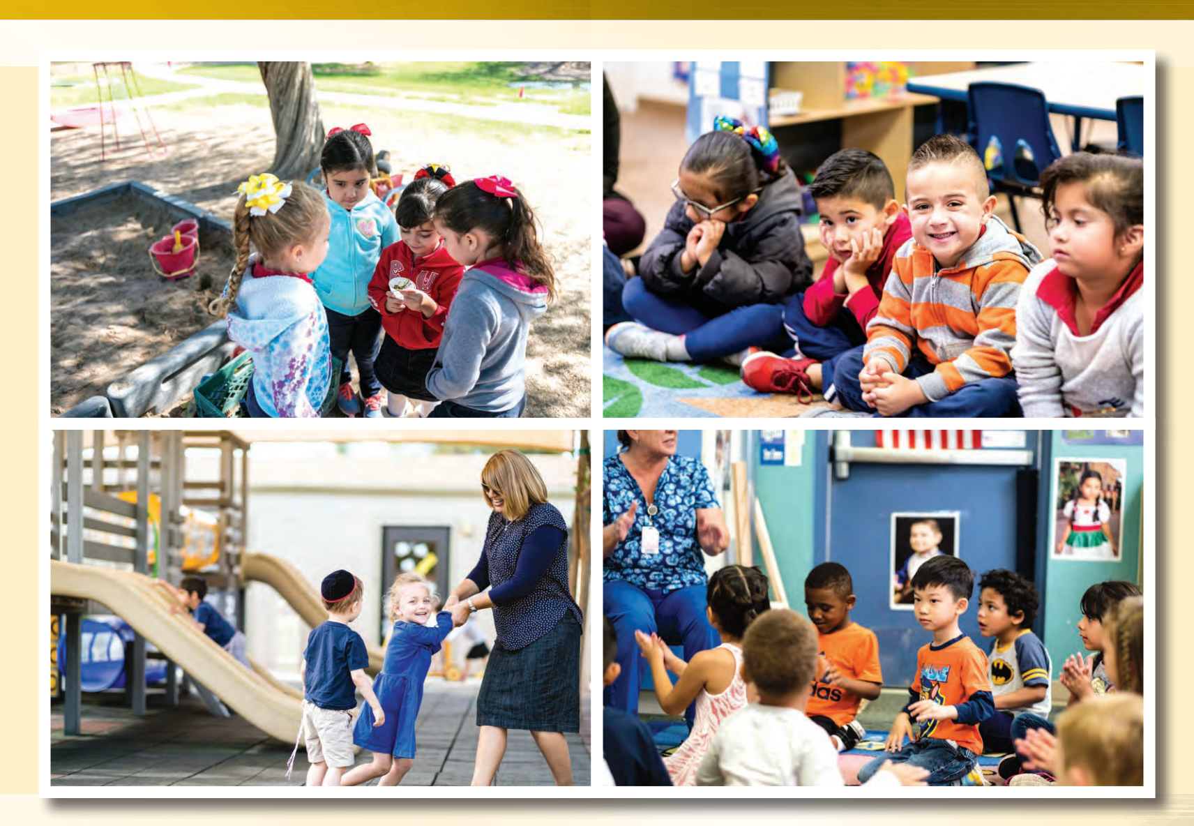
Social Studies Standard