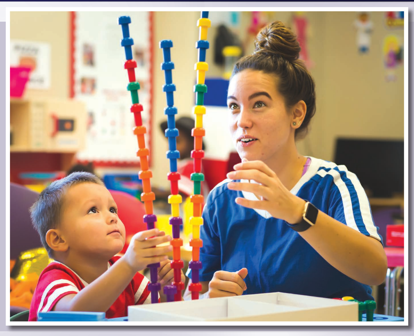
Arizona Early Learning Standards 4th Edition