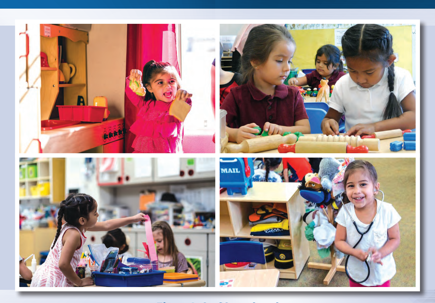
Fine Arts Standard